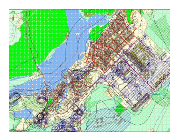
Figure 1: Map of nitrogen dioxide dispersion

15, 16]. The calculations performed have provided a picture of the distribution of air pollution level throughout the city of Naberezhnye Chelny. (Fig. 1 - Map of nitrogen dioxide dispersion.)